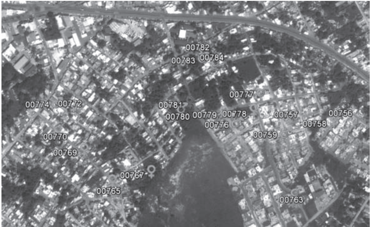
Figure 5. Image of fieldwork follow-up quality indicators, 2015 GATS Mexico

to projection of the population aged 15 years and above by region, area, gender and age group.