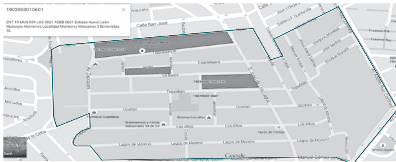
Figure 1. Image of selected PSU and blocks

The Mexico team working along with CDC staff members, conducted other important quality control activities, including examining the length it took to complete a questionnaire and the length of time it took to complete each question. This was possible because the devices registered the interview